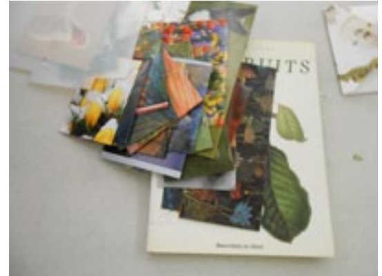
Above left: Scribes look on as Wendy shows a few moves with the parallel pen. Above right: Some of the samples and envelopes we made!