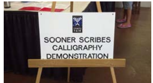
Booth sign at OK State Fair

Sooner Scribes at the Oklahoma State Fair was a giant success.