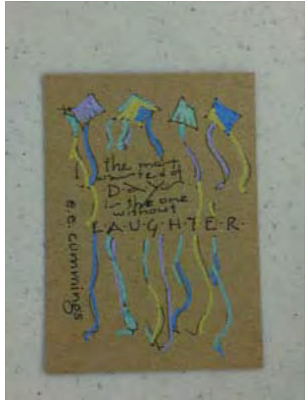
Example of an Artist Trading Card.