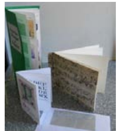
Samples of Simple stitched books being used