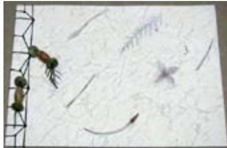
Hemp-leaf binding booklet