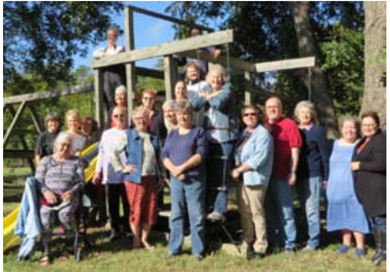
Photo Highlights from the October Meeting