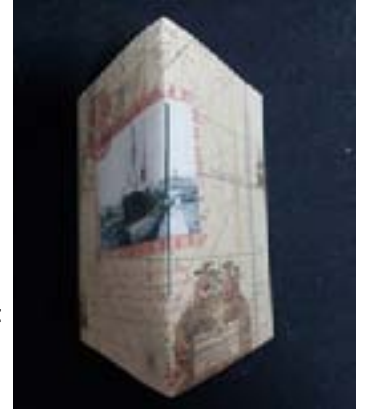
Outside view of stitched booklet