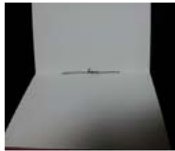
Inside view of stitched booklet