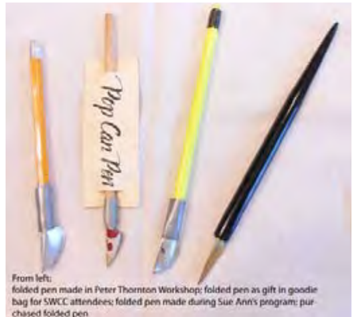
From left: folded pen made in Peter Thornton Workshop; folded pen as gift in goodie bag for SWCC attendees; folded pen made during Sue Ann's program; purchased folded pen