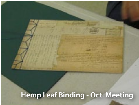
Hemp Leaf Binding - Oct. Meeting

November 2011 Sooner Scribes Calligraphy Guild of Oklahoma City, Oklahoma www.soonerscribes.com