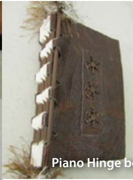
Piano Hinge book - Nov. Meeting