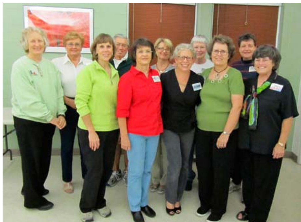
Sooner Scribes 50 th Anniversary Party