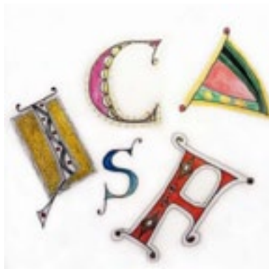
Left: Decorated Lombardic Capitals - June 4, 2016 Right: Accordion Flag Book - June 5, 2016