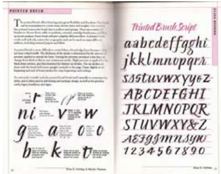
Example of brush script taken from The Speedball Textbook , 23rd Edition, pages 52 and 53.

Monthly meeting dates are listed in the newsletter Events Calendar. Meetings are held on the fourth Monday of each month at 7:00 p.m. at the Will Rogers Garden Center, 3400 NW 36 th Street, Oklahoma City, OK, unless otherwise specified.