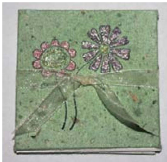
Squash Book closed