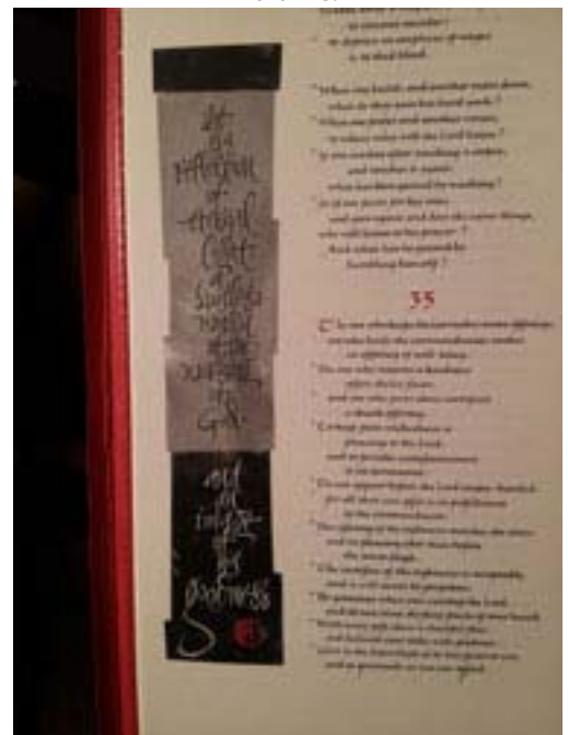
A page from the St. John's Bible showing some of the artistry and calligraphy which is sprinkled lavishly throughout each volume.