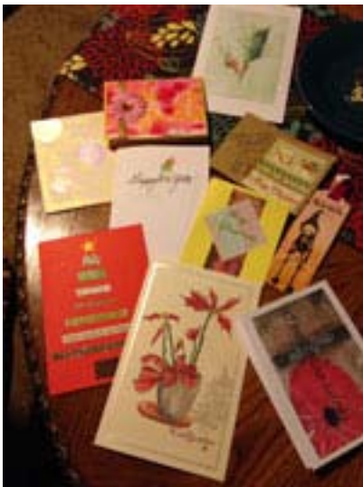
Some of the lovely cards exchanged at our January meeting! Good Job Scribes!