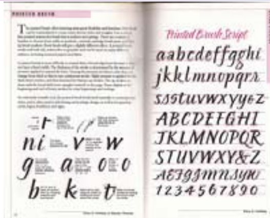
Example of brush script taken from The Speedball Textbook , 23rd Edition, pages 52 and 53.

Monthly meeting dates are listed in the newsletter Events Calendar. Meetings are held on the fourth Monday of each month at 7:00 p.m. at the Will Rogers Garden Center, 3400 NW 36 th Street, Oklahoma City, OK, unless otherwise specified.