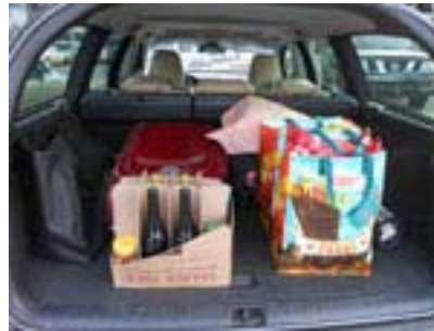
Trader Joe's in Ft. Worth, TX