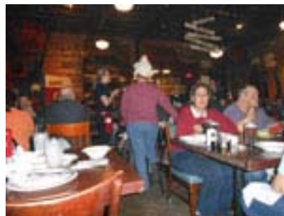
Babe's Famous Fried Chicken restaurant in Sanger, TX.