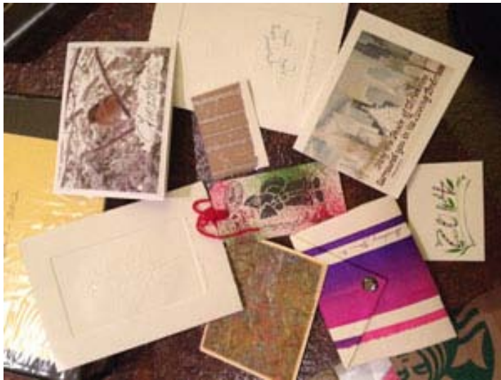
Right: Cards exchanged this year.