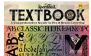
24th Centennial Edition