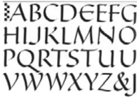
Upper and Lower case exemplars of the Roman hand.