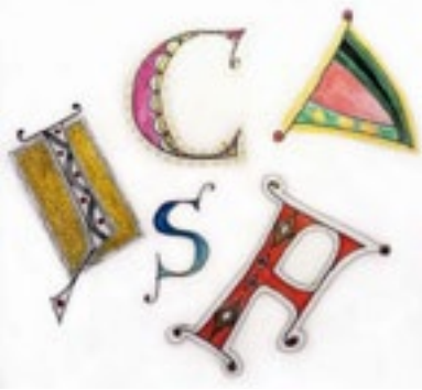
Left: Decorated Lombardic Capitals - June 4, 2016 Right: Accordion Flag Book - June 5, 2016