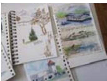
Pat Lynn's sketchbook & journal

info on their travels - so come to the meeting and see photos and examples, hear testimonials, and sign up for smashing door prizes.