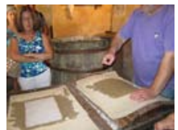
Learning about paper from a master printer.